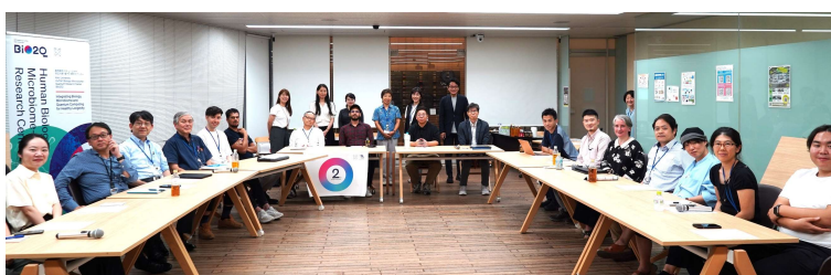
Bio2Q 2024. Original Photo

Young researchers played a key role, sharing insightful suggestions on how to foster greater interdisciplinary collaborations through the Open Lab. Lively discussions were also held around the establishment and potential use of various data repositories to enhance operational efficiency and accessibility.