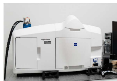
Far Left: LC-MS Orbitrap 180 Below: Zeiss Lightsheet 7

automated collection (photo at page 2 above). Our office space next to the Open Lab is home to young researchers working in various disciplines.