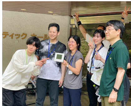
Source: Bio2Q 2025 Retreat. Original Photo